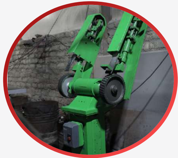
Belt Grinder Machine