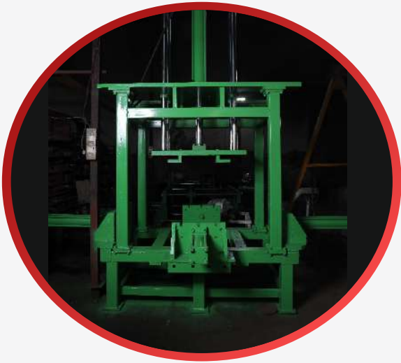
Vertical Hydraulic Machine